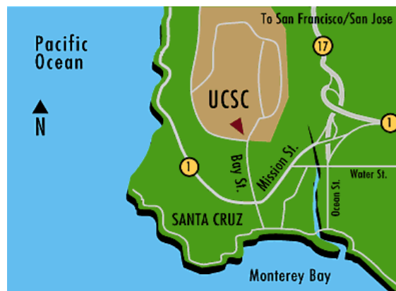
Figure 1. Map of Santa Cruz Area

See Figure 1. North on Hwy 1, which is called Mission Street. Turn right on Bay Street, go up hill until you reach Main Entrance for Campus at Bay and High Street.