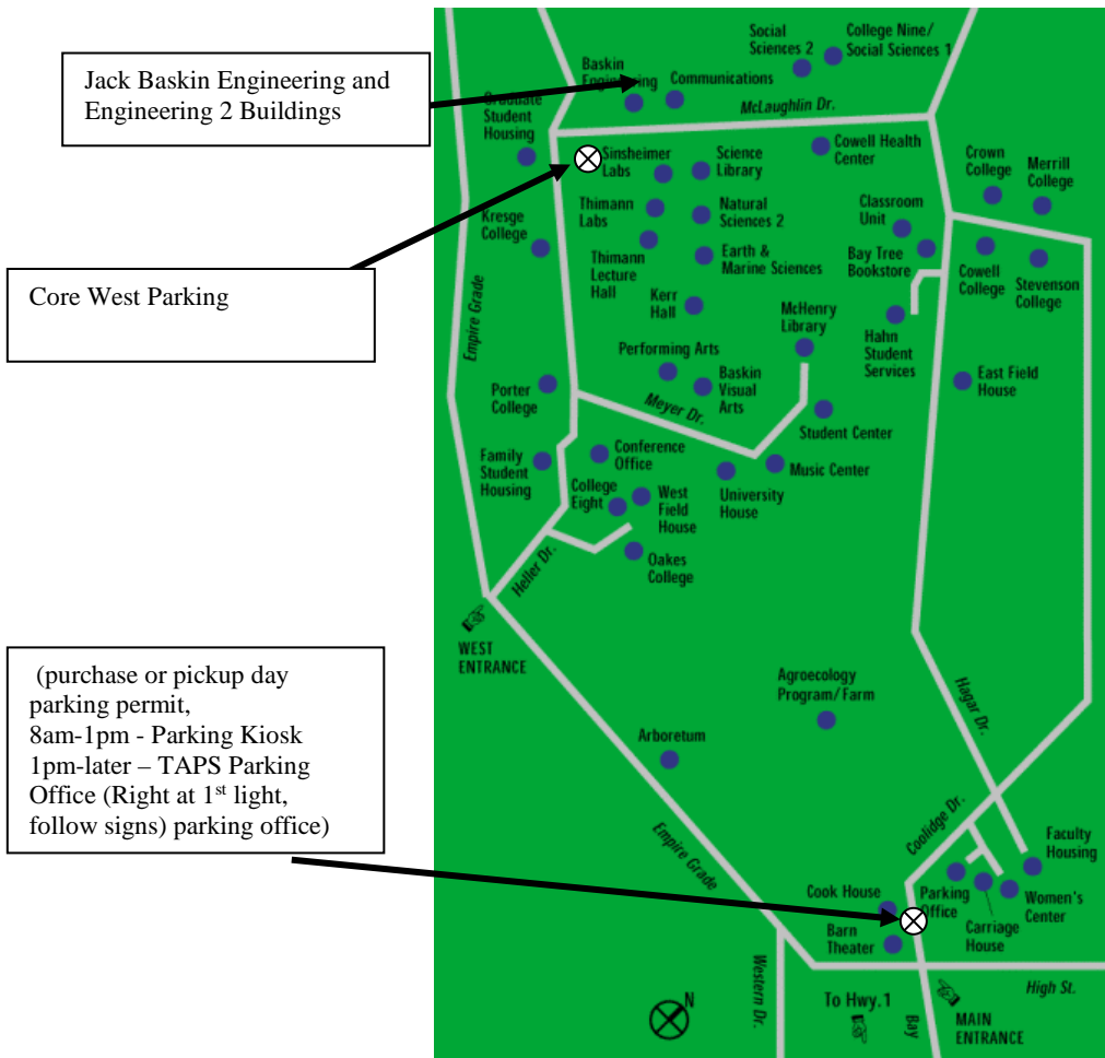
Figure 3. UCSC Main Campus Diagram

Drive to Core West Parking Structure located at corner of Heller and McLaughlin Drives, either via West Entrance or continue up Coolidge until it becomes McLaughlin Drive. See Map below.